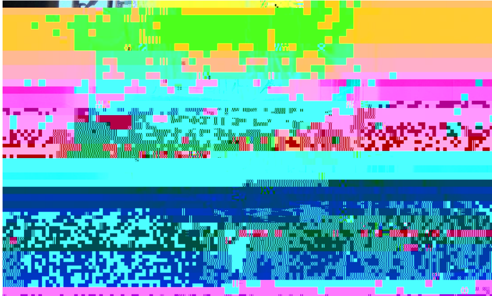
Near front wall moisture protection application is continuous and typical.