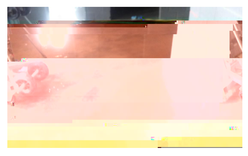
Corridor standing water (Typical)