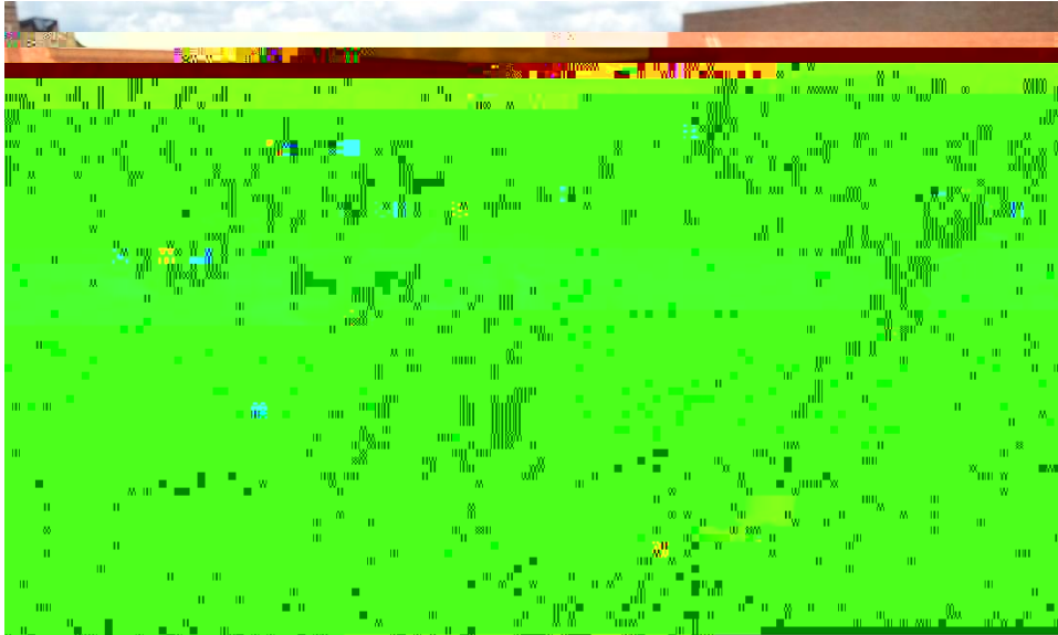
Roof contractor install is aggressive and inspections are current and documented