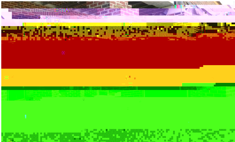
West Elevation entrance see doors and masonry brick veneer are placed and ready for cleaning